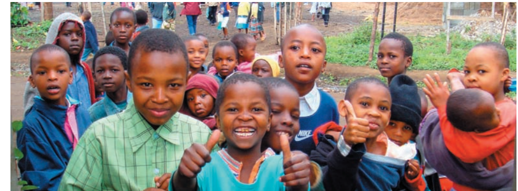
THANK YOU... THANK YOU... THANK YOU... THANK YOU... THANK YOU... THANK YOU... THANK YOU...

You can contribute in many other ways. See overleaf for details. Could you contribute one day of your wages a year? Will you remember us in your will ? Our policy is to acknowledge all donations unless you request otherwise.